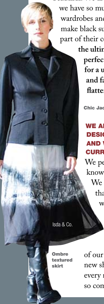
Isda & Co.