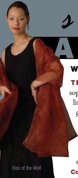
Kiss of the Wolf