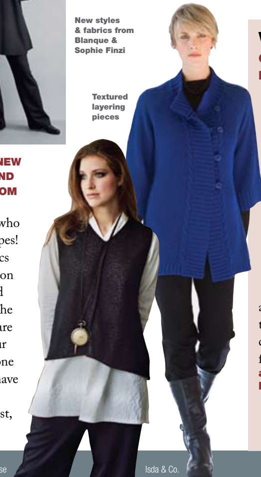
Isda & Co.