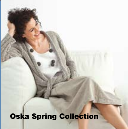
Oska Spring Collection