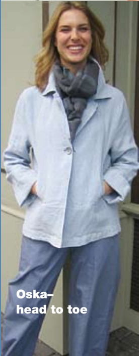
Oska— head to toe